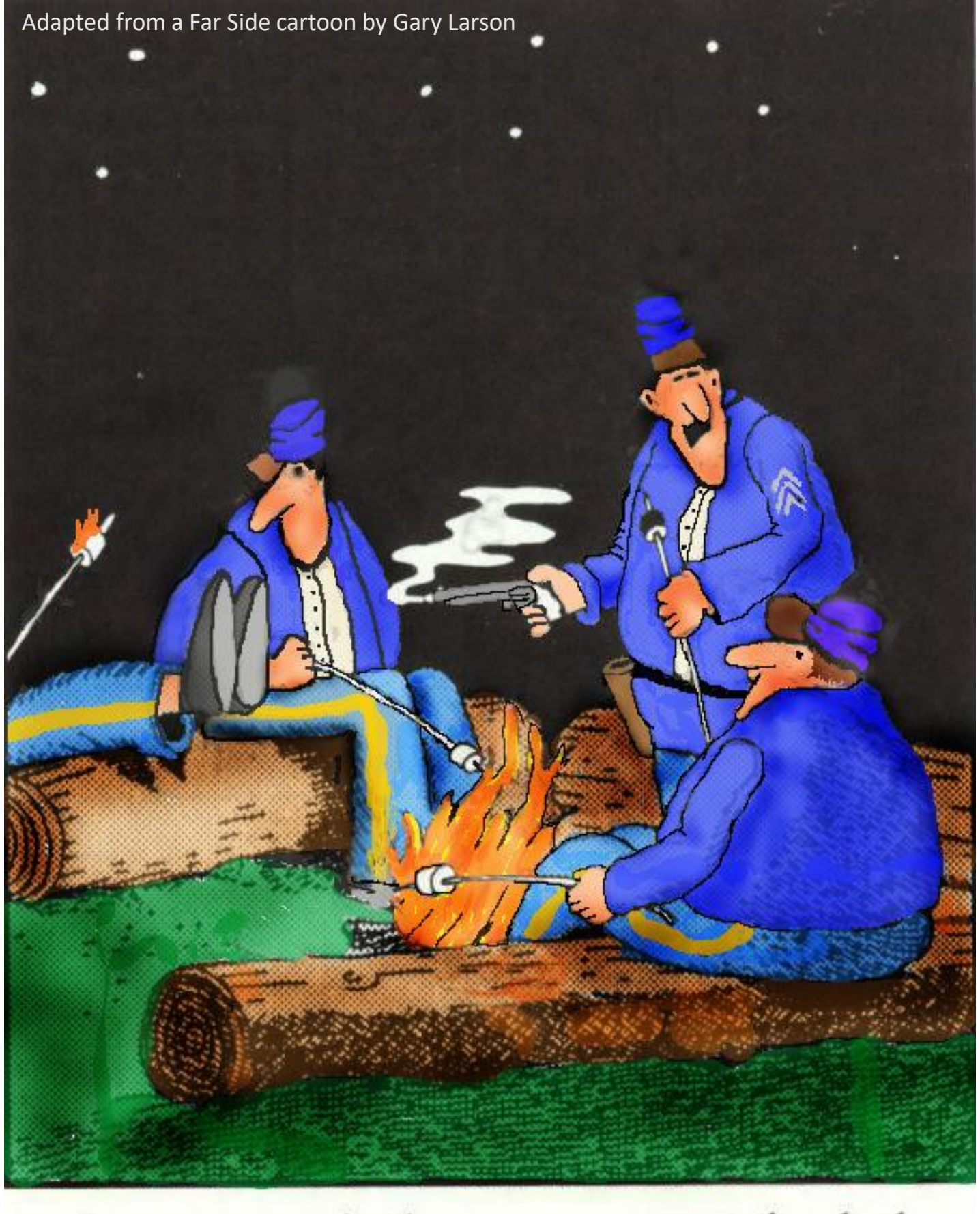
"You guys are both witnesses. ... He laughed when my marshmallow caught on fire."